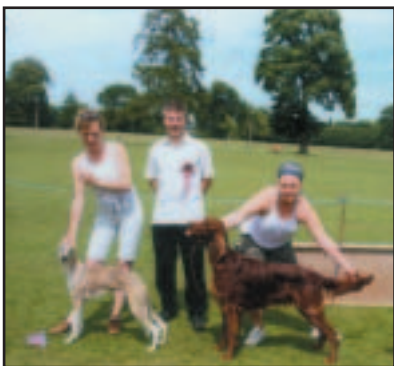
The Whippet won the Best in Show and the Best Puppy in Show and Irish Setter was the Reserve Best in Show.