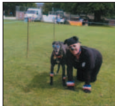
Winner of the 'dog most like owner' - or was this the 'owner most like dog' class?